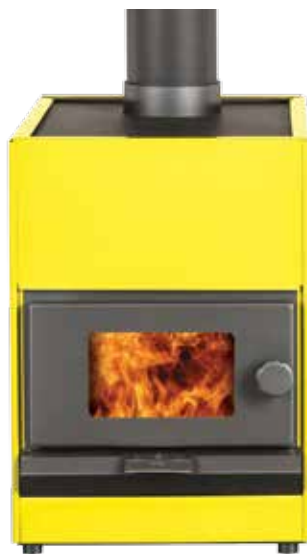
Pyro IV Grey in Schweppes Yellow (colour upgrade)