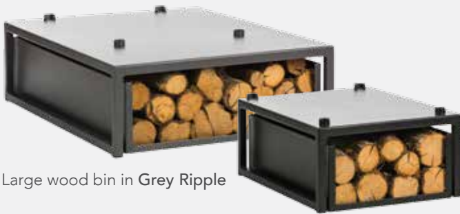
Large wood bin in Grey Ripple