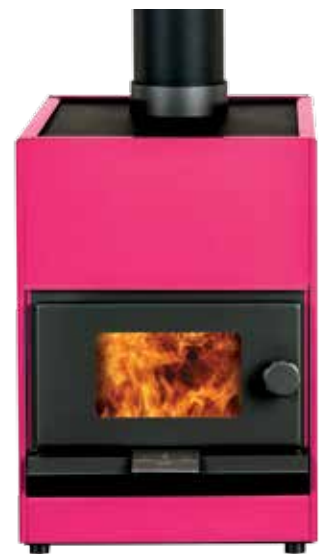
Pyro IV Black in Tickled Pink (colour upgrade)

PYROCLASSIC FIRES IS THE FIRST WOOD FIRE MANUFACTURER IN THE WORLD TO ACHIEVE CARBONZERO CERTIFICATION!