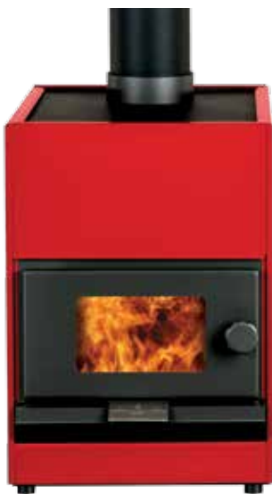
Pyro IV Black in Cola Red (colour upgrade)

AS/NZS4012:1999 • AS/NZS4013:1999 • AS/NZS4012:2014 AS/NZS4013:2014 • AS/NZS2918:2001 • EN13240:2001 • A2:2004 • Ecan authorisation: 121121 (Dry), 121122 (Wet)