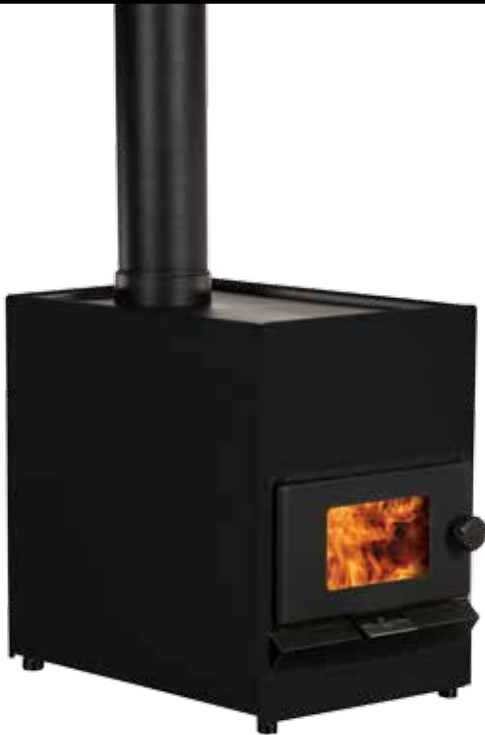
Pyro IV Black (standard)