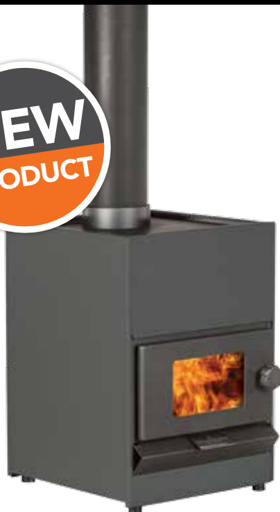
Pyro Mini Grey (standard)