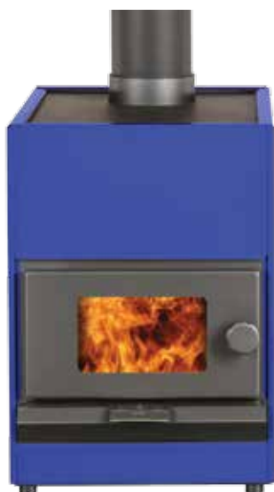
Pyro Mini Grey in Hurstmere Road (colour upgrade)

The Pyroclassic Mini has been tested to the following standards: AS/NZS4012:2014 • AS/NZS4013:2014 • AS/NZS2918:2001 • Ecan authorisation: 174996 (Dry), 175008 (Wet)