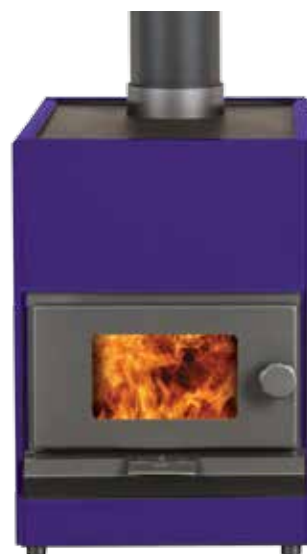
Pyro Mini Grey in Dark Violet (colour upgrade)