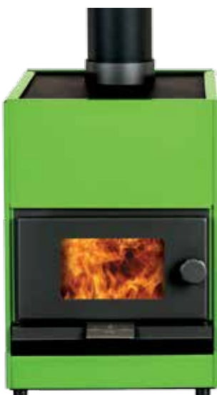
Pyro Mini Black in Telecom Green (colour upgrade)